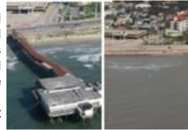
Before Ike After Ike

The future development on Galveston is important to everyone who cares about the wetlands and wildlife on the Texas coast -- and Galveston is the closest piece of coast to Houston. Come hear what you need to know to protect our backyard wetlands.🌐